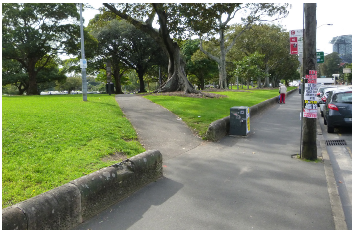
EXISTING CITY ROAD SOUTHERN PARK ENTRY TO BE UPGRADED TO IMPROVE