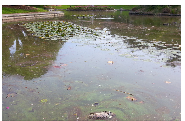
POOR WATER QUALITY TO BE IMPROVED WITH RECIRCULATION SYSTEM AND WETLANDS