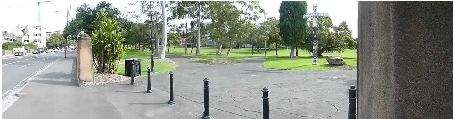
EXISTING CITY ROAD CLEVELAND SREET PARK ENTRY TO BE UPGRADED